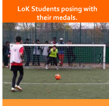
oK goalkeeper anticipating. penalty-kick.