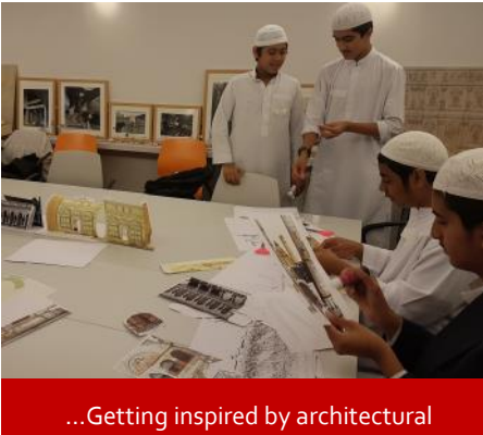
...Getting inspired by architectural structures.

"They then showed us a presentation and split us up into 2 groups, one for doing the art on an iPad and the other on paper."