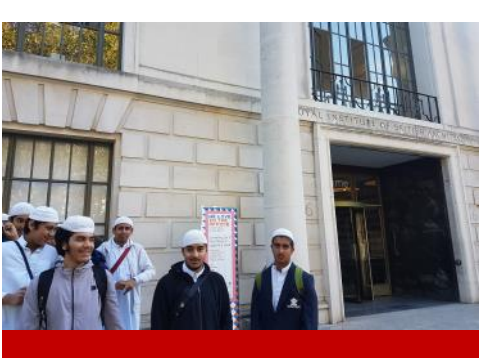
Students gather outside the RIBA building.

When we got there, we were greeted by two members of staff, a man named Wilson