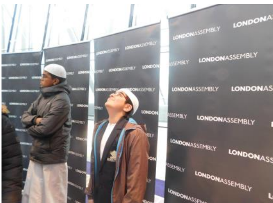
Exploring the amazing architecture

Students were taken for a guided tour around the fantastic iconic building as you can see in the pictures here. Having learnt about the role of the Mayor, students were fortunate to go inside the Assembly chamber and see the very spot the Mayor of London sits in the London Assembly Hall.