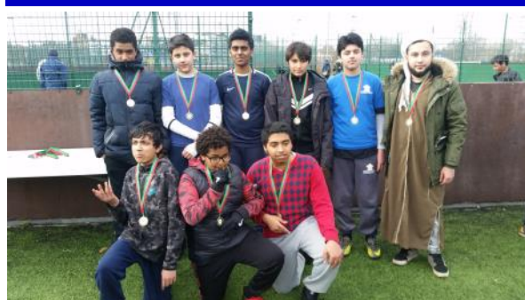
Year 9 Team