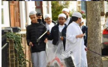
Students clearing the streets around the school