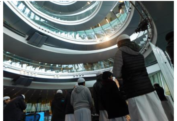
Students in Yr 8 touring City Hall

The trip was an opportunity for students to learn more about London, its history and how it is governed.