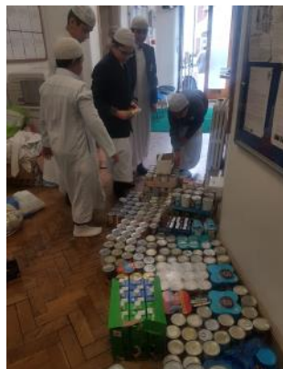
Students donating food & essentials

P upils at Lantern of Knowledge School have sent off two van loads of food donations for Waltham Forest's largest food bank, Eat or Heat, collected all within just one week!