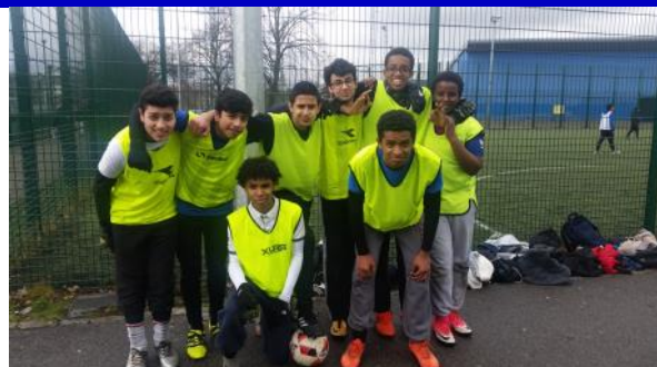
Year 10 Team