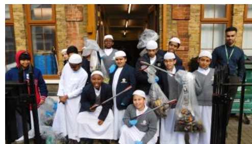
Students taking part in the big Spring clean.