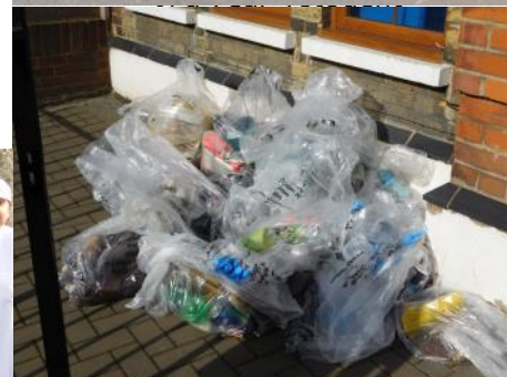
Bags full of litter collected by students.