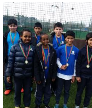
LoK Yr 8