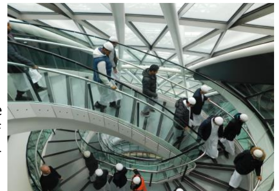
City Hall’s spiral staircase

From the second floor you can see into the Chamber, where debates and Assembly meetings take place affecting the governance of London, through the Greater London Authority.