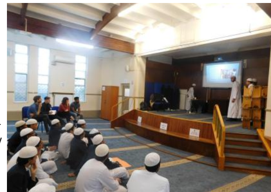
Students pitching their grand ideas.